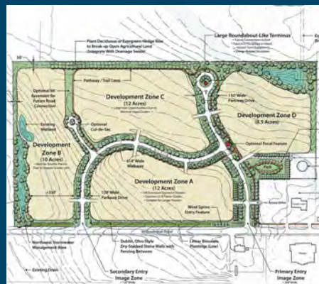
65-acre Technology Park Development, Michigan