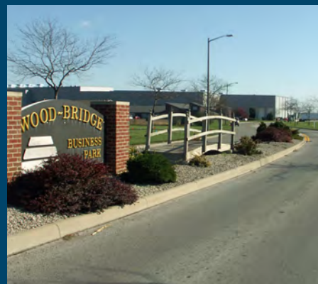
141-acre Industrial Park Development