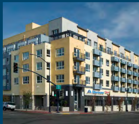
Mixed-Use Residential/Commercial Development