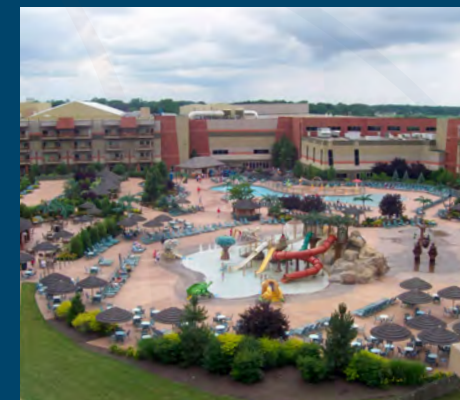
140-acre Indoor Waterpark Resort Development

“We create an environment for collaboration that can be sustained through integrated design and construction.”