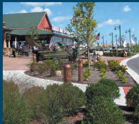
250-acre Outdoor Retailer Site Development