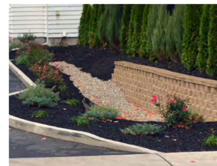
Commercial-Low Impact Design